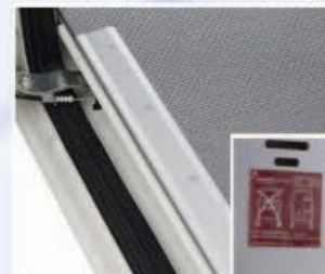
VANYCARE® Aluminum Finishing Strips