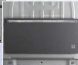
VANYCARE® impact protection