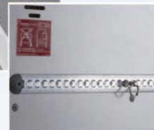
VANYCARE® Lashing Rails